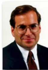
By Todd Harff Creating Results, LLC

A carefully planned and well-executed pre-marketing program can produce tremendous results. But a lackadaisical program can be disastrous. This is particularly true if your company is trying to reach the 55+ market.